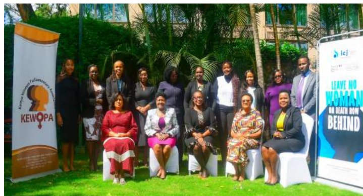
KEWOPA, ICJ, and civil society members during discussions on advancing justice for women on death row.

Participants reflected on legislative and policy pathways to advance gender justice, protect human rights, and strengthen support systems for women in the criminal justice system.