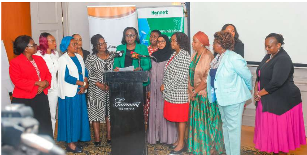
KEWOPA members address press, urging stronger health governance and immunization funding.

Kenya's health sector faced significant challenges this year, including vaccine stockouts and rising maternal mortality. In response, the Health NGOs Network (HENNET) and the Kenya Women Parliamentary Association (KEWOPA) strengthened their partnership to improve health governance through targeted parliamentary engagement. Their collaboration aimed to elevate civil society input and advance reforms that support sustainable health financing and effective policy oversight.