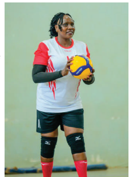
Hon. Rael Kasiwai in action at the EAC Inter-Parliamentary Games in Uganda.

This participation strengthened bonds among the members and demonstrated their ability to perform under pressure. KEWOPA celebrates their dedication, unity, and leadership, reflecting the same drive and excellence they bring to their work in public service.