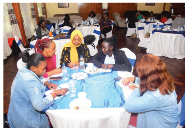
Participants engage in discussions to strengthen women's parliamentary voices.

The sessions emphasized confidence-building, collective power, and the creation of inclusive political environments. Practical tools for campaigning, messaging, and mobilization were shared to amplify women leaders' effectiveness and impact within and beyond Parliament.