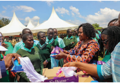
KEWOSA senators engage Busia students during Senate Mashinani.

On Monday, 6th October 2025, the Kenya Women Senators Association (KEWOSA), led by Chairperson Senator Veronica Maina, conducted a Senate Mashinani engagement in Busia County to address rising cases of HIV, adolescent pregnancies, and sexual and gender-based violence. The senators engaged students at St. James Kwang'amor and St. James Nasewa schools and later held a multi-sectoral forum with county and national stakeholders. Senator Maina cited alarming trends among adolescents and emphasized poverty as a key driver of vulnerability. KEWOSA distributed menstrual hygiene kits and sensitized learners on their legal protections under the Sexual Offences Act, while calling for coordinated action and stronger enforcement of child protection and education laws to safeguard the wellbeing of children and adolescents in Busia County.