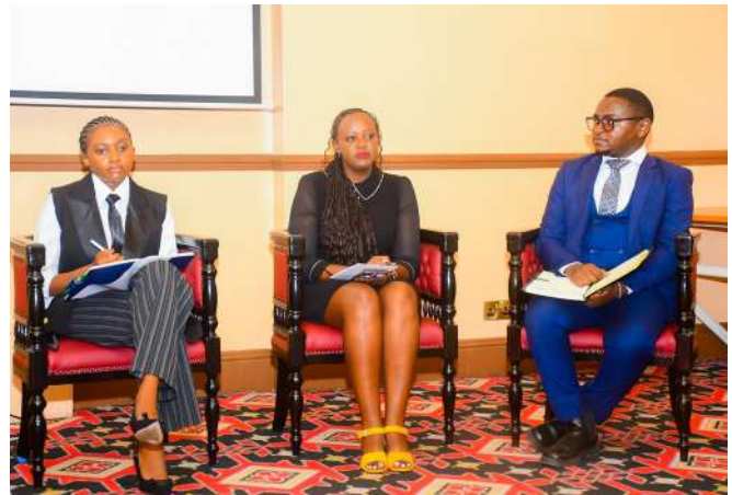
Women leaders and youth share insights in an intergenerational mentorship dialogue.

Structured mentorship pathways were explored to link experience with innovation, ensuring women's voices remain central in governance. KEWOPA reaffirmed its commitment to nurturing inclusive leadership and political continuity.