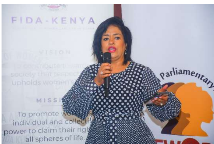
Hon. Passaris highlights women's role in environmental governance dialogue.