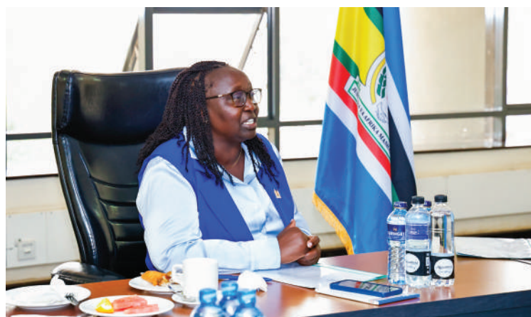
Gender CS, Hon. Hanna Cheptumo speaks during KEWOPA's meeting on advancing women's leadership and gender equality.

The meeting highlighted the need for collaboration to strengthen justice systems, secure fair resource allocations, and fully implement gender equality policies. KEWOPA reaffirmed its commitment to inclusive governance and women's leadership.