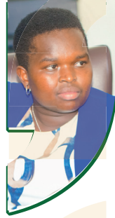
Hon. Benard Kitur Nandi Hills Constituency MP.

Accountability failure occurs between budget approval and execution particularly cash disbursement, grants tracking, and facility-level autonomy.