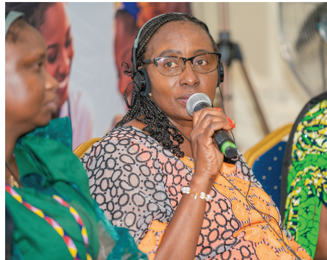
Hon. Beatrice Elachi speaks on strengthening maternal and newborn health systems.

Hon. Kitur pointed to gaps in facility-level tracking, weak enforcement mechanisms, and limited parliamentary follow-up after budget approval. A consistent message emerged: sustainable financing, effective oversight, and inclusive systems are critical to improving outcomes for mothers, newborns, and adolescents.