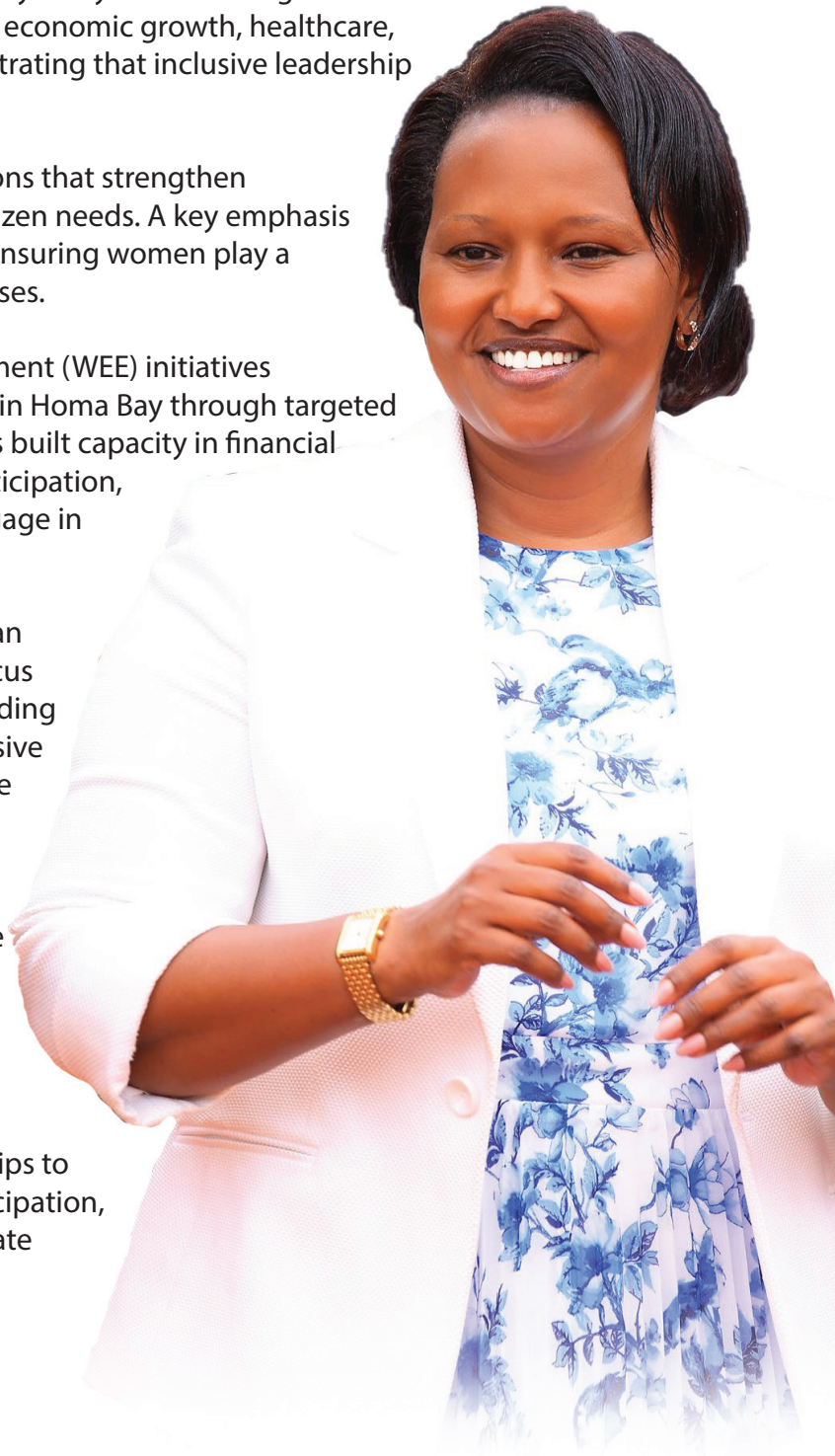
Hon. Leah Sankaire, MP Chairperson, KEWOPA

Going forward, KEWOPA will prioritize implementation, strengthen legislative influence, and deepen partnerships to ensure sustained impact across women's political participation, economic empowerment, the care economy, and climate action.