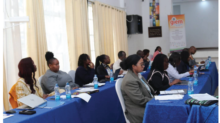
Participants listen in on gender-responsive and inclusive budgeting.

The workshop also reviewed draft Gender-Responsive Budgeting guidelines, contributing to more transparent and inclusive public finance systems.