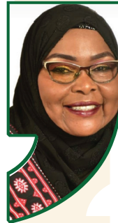
Hon. Zamzam Mohammed County MP, Mombasa

We must increase funding for vocational training, enterprise, innovation, sports, digital skills, and affordable credit to expand opportunities for young people. Investing in youth strengthens Kenya's economy and secures sustainable development.