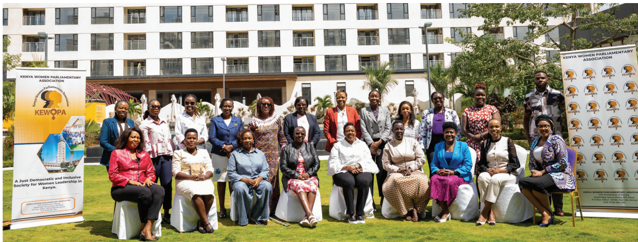
Women members of parliament and partners come together for the training on TFGBV

As digital technologies continue to shape leadership, governance, and political engagement, the Kenya Women Parliamentary Association (KEWOPA), in partnership with Oxfam, the Communications Authority of Kenya, the National Police Service, IREX, and other partners, held a series of trainings in June 2026 on Artificial Intelligence (AI), online safety, digital rights, and emerging technologies. The programme comprised two trainings for women Members of Parliament and two additional trainings for the communications teams that support them.