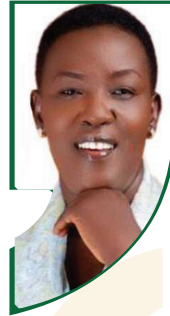
Hon. Beatrice Ogolla Nominated Senator

Every mother deserves a safe delivery, and every child deserves a healthy start to life through timely immunization.