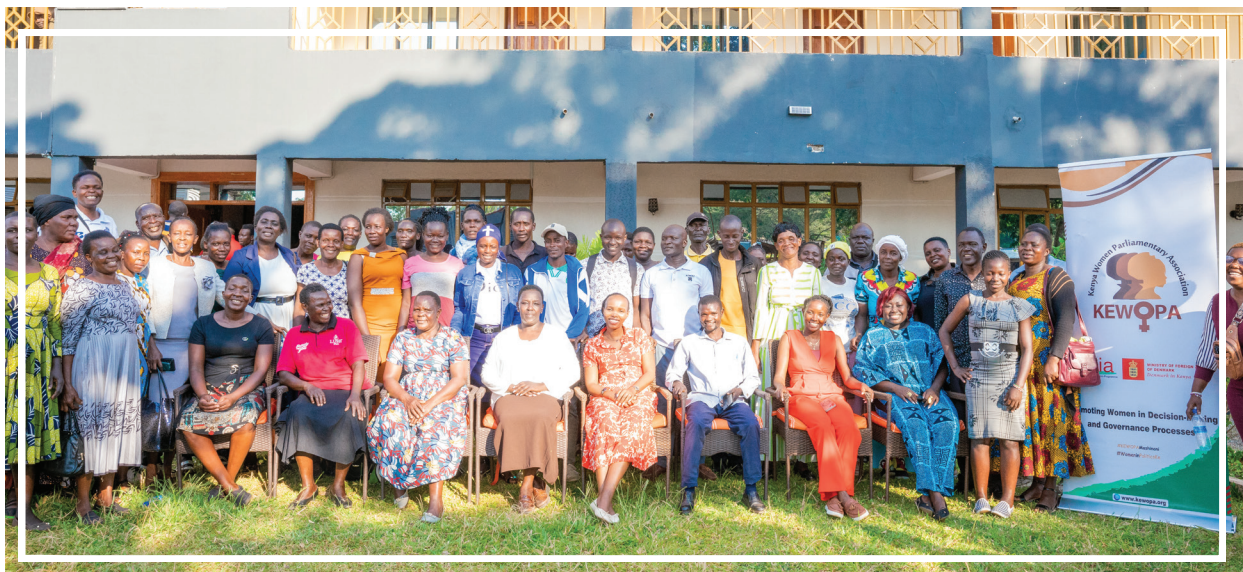
Participants at the Inclusive Electoral Governance training in Homa Bay County