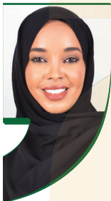
Hon. Fatuma Jehow County MP, Wajir

Long standing inequities in girls' education continues to limit women's opportunities and meaningful participation in leadership.