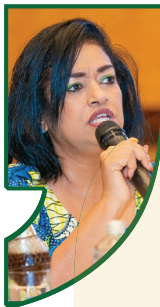
Hon. Esther Passaris County MP, Nairobi

Artificial Intelligence is no longer a digital concept, it is now a part of our everyday lives.