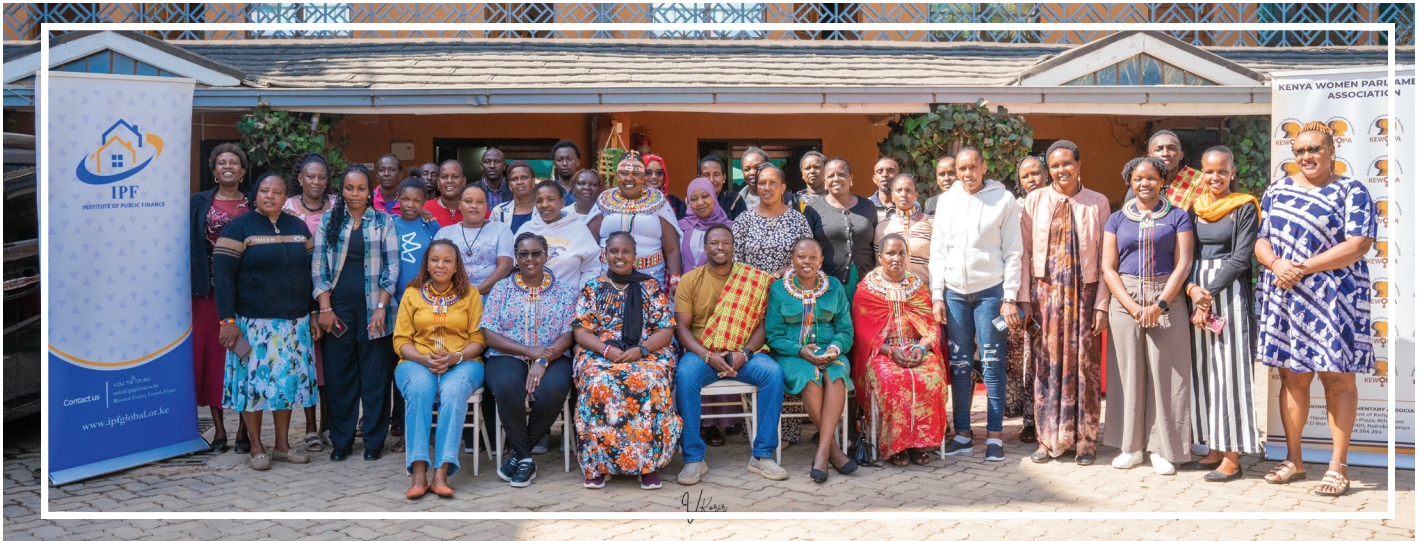
Participants during the SPALTA Phase II Women Entrepreneurs Capacity Building Workshop in Maralal, Samburu County.

KEWOPA, in partnership with the Institute of Public Finance (IPF), conducted a two-day Women Entrepreneurs Capacity Building Workshop in Maralal, Samburu County under the Strengthening Parliamentary Leadership for Transformative Action on Health and Gender Outcomes (SPALTA) Programme Phase II.