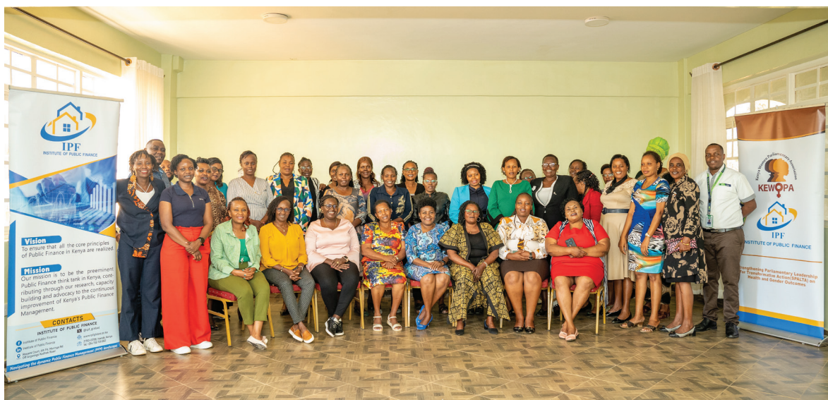
Participants at the Financial Literacy and Women's Economic Empowerment Training under SPLTA Phase II Programme.

The Financial Literacy and Women's Economic Empowerment Training under the Strengthening Parliamentary Leadership for Transformative Action Phase II Program brought together women leaders, participants, and stakeholders to strengthen knowledge and skills aimed at advancing women's economic participation and sustainable livelihoods.