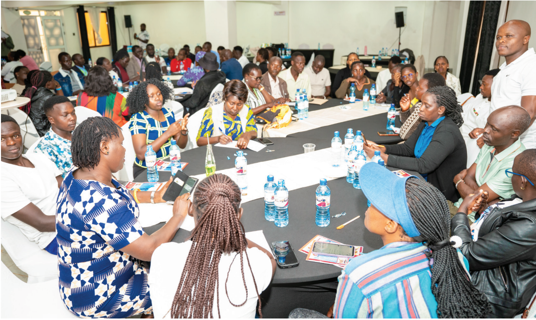
Participants engage in discussions at the multi-stakeholder dialogue on inclusive electoral governance.

KEWOPA, in partnership with Uraia and with support from the Embassy of Denmark in Kenya and Somalia, convened a multi stakeholder dialogue on Enhancing Inclusive Electoral Governance through Women and Youth Led Advocacy and Policy Engagements. The forum brought together women leaders, youth representatives, civil society organizations, Persons with Disabilities, electoral stakeholders, local administrators, and community representatives to discuss democratic participation and inclusive governance.