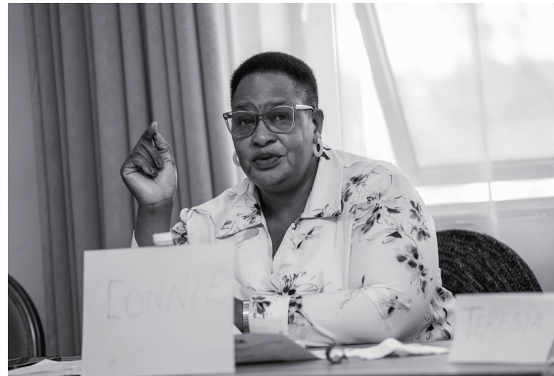
Senator Consolata Nabwire speaks during strategic engagement forum.

They underscored the importance of delivering leadership with dignity while intentionally shaping public narratives around women's leadership. The discussion reinforced the need for women MPs not only to be represented in public discourse, but to actively tell their own stories in clear, strategic, and impactful ways, thereby strengthening their influence in governance and representation.