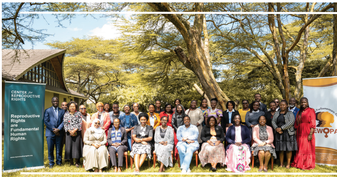
Participants at the regional training on Sexual Reproductive and Maternal Health Rights.

Ensuring access to sexual, reproductive, and maternal health services requires strong laws, responsive institutions, and effective leadership. To advance this agenda, KEWOPA, in partnership with the Center for Reproductive Rights, convened a regional training for judges and parliamentarians aimed at strengthening judicial and legislative capacity to promote Sexual, Reproductive and Maternal Health Rights. The training brought together key actors from the justice and governance sectors to explore the legal, policy, medical, and social dimensions of reproductive health.