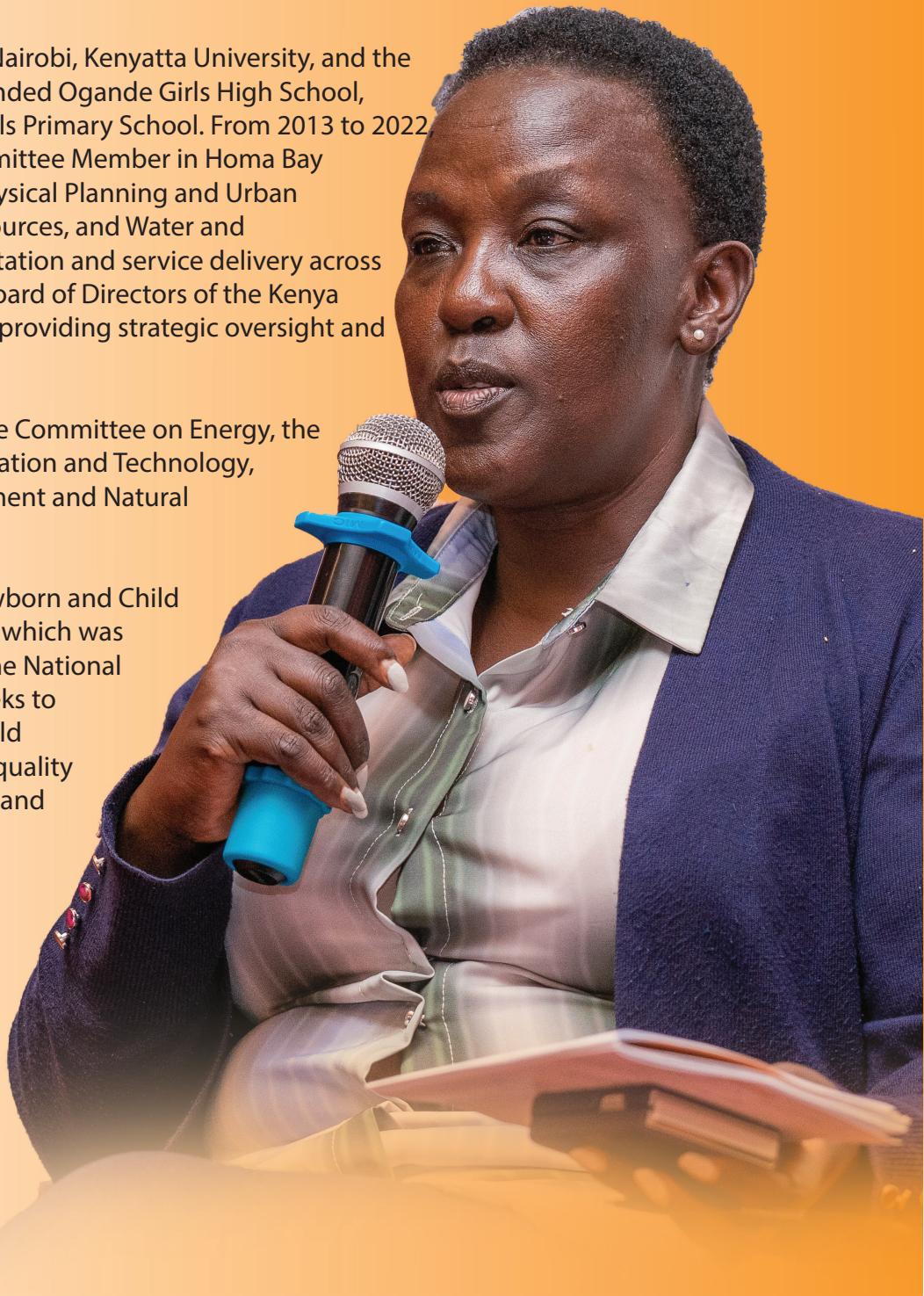
Beatrice Ogolla Nominated Senator

Through her legislative work, Senator Ogolla continues to champion maternal health, sustainable development, natural resource management, and improved public service delivery.